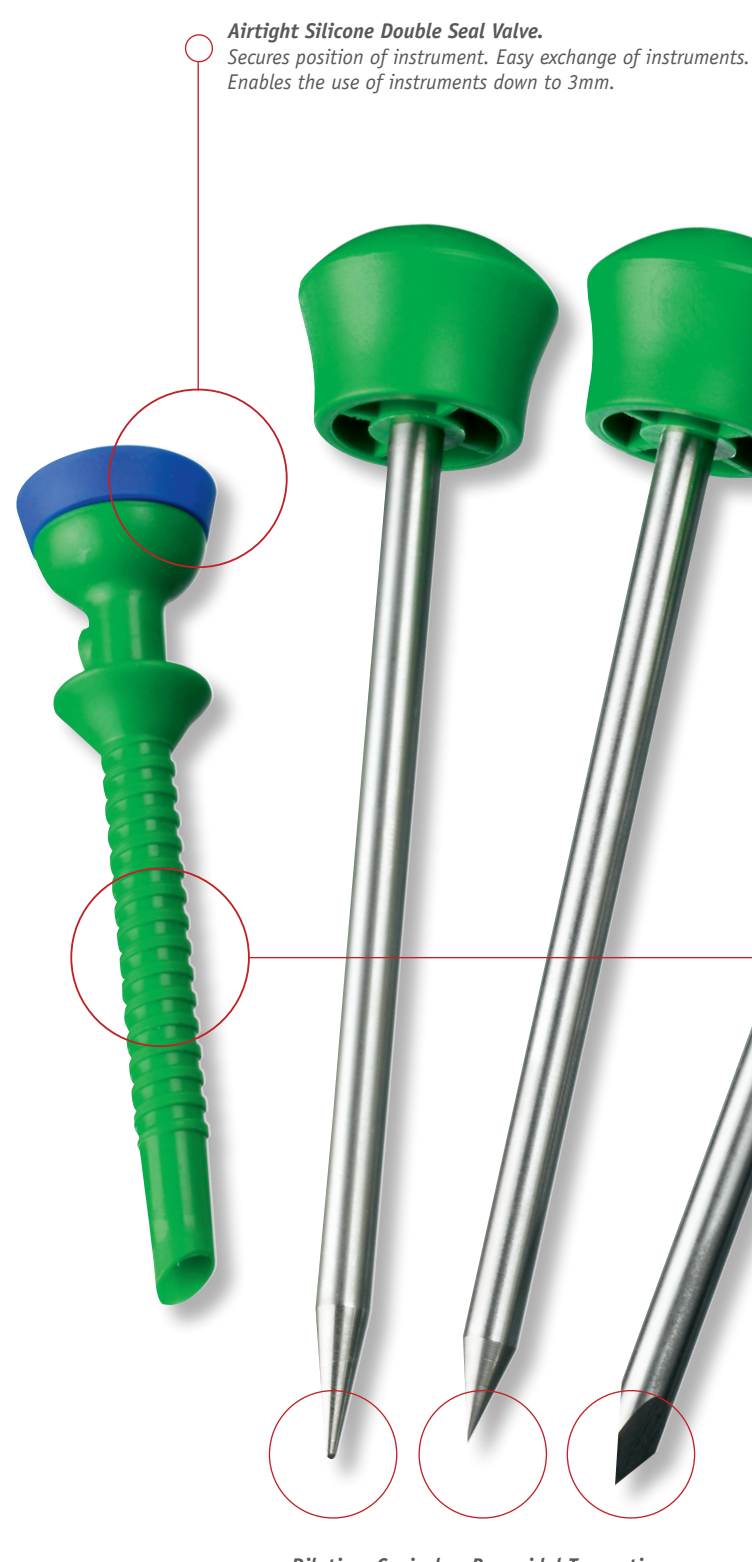
Dilating, Conical or Pyramidal Trocar tip. Supports the most used entry techniques.

Non-traumatic Fascia Thread. Safe and firm anchoring of cannula.